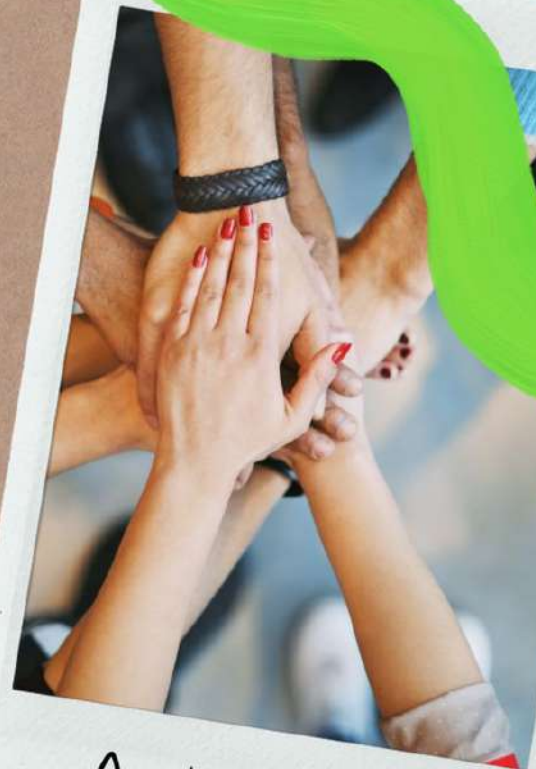
Academic Third Mission

The project TENACITY (ACADEMIC THIRD MISSION: community Engagement for a knowledge based society) is an Erasmus Cooperation partnership in higher education which involves 9 partners from 7 different countries. The project addresses the Erasmus Plus Horizontal priority for "Common values, civic engagement and participation" with Academic Third Mission becomes a strategic area to promote fruitful collaboration between academia and society.